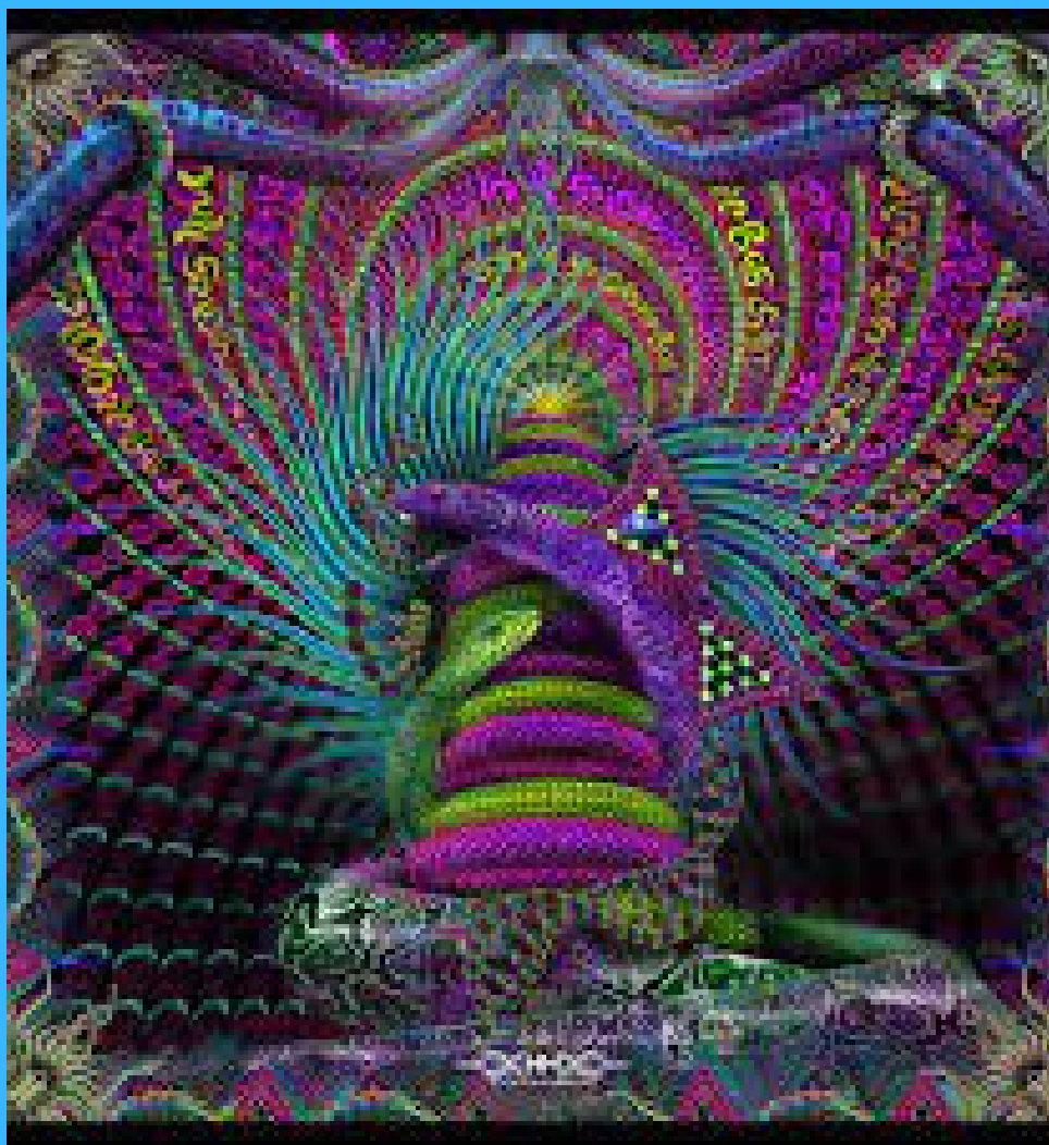
"Kundalini Rising" – By Hakan Hisim

"What's happening isn't that the psychedelic is stimulating the imagination; instead, the hallucination we normally call reality is interrupted, and a deeper reality of universal consciousness leaks in."